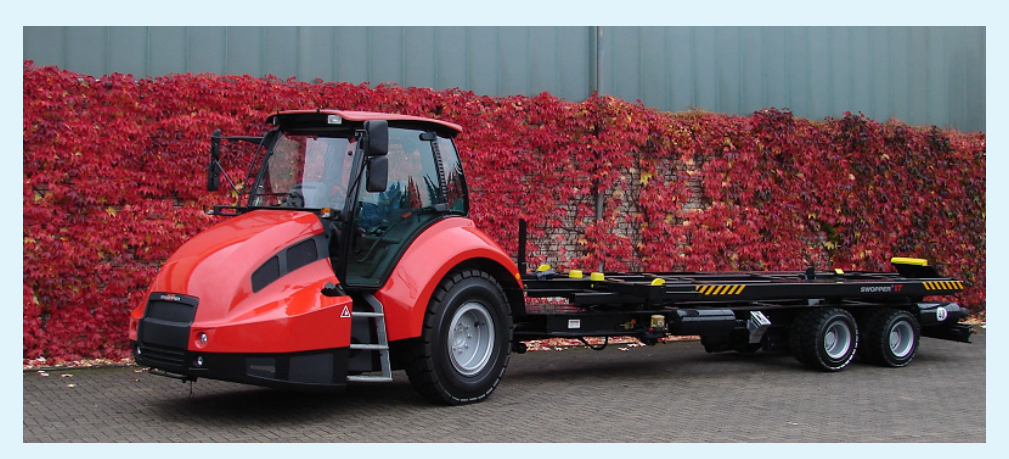
Load carrier Swopper XT for relocation of containers

The final inspection was carried out by the CEO who was delighted after a test drive, saying "no comparison to what it was before". He planned the vehicle for further use in the practice.